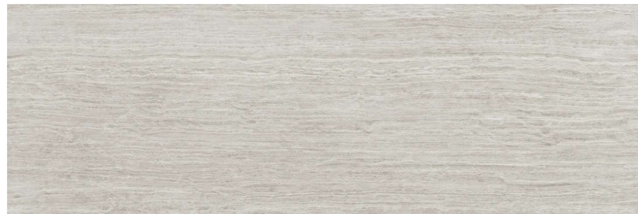
Travertino Grey 100x300 cm

In the main bathroom, a box is designed for the shower and bathtub area, fully tiled and with a great visual effect, with large-format rectified porcelain tiles with a travertine-effect finish.