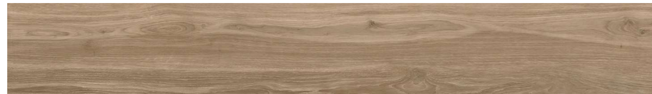
Origin Umber 22,5 x 180 cm

In the main bathroom, a box is designed for the shower and bathtub area, fully tiled and with a great visual effect, with large-format rectified porcelain tiles with a travertine-effect finish.