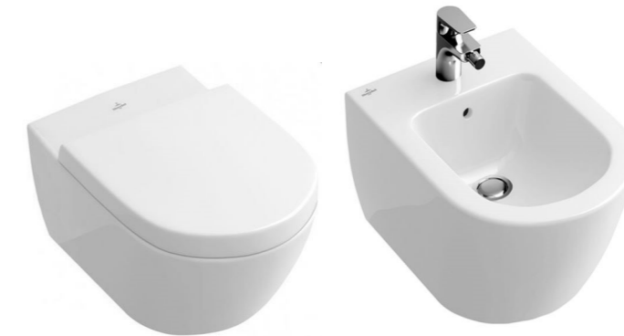
Non-binding figurative faucet.

Wall-hung toilet with cistern built into the partition with a half and full flush button, cushioned seat and lid. Villeroy Boch model SUBWAY 2.0, in all bathrooms and toilet. Bidet of the same model in the master bathroom.