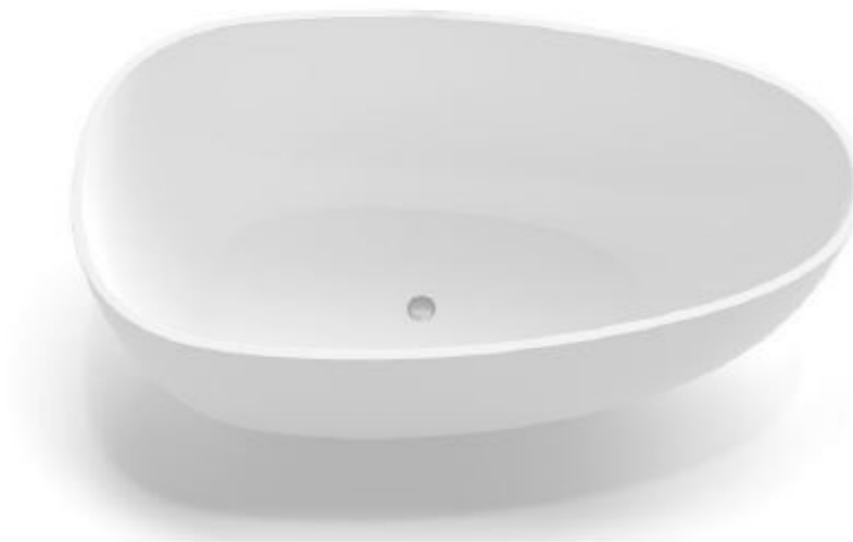
Non-binding figurative image

170 x 88 cm freestanding bathtub with floor-mounted tap.