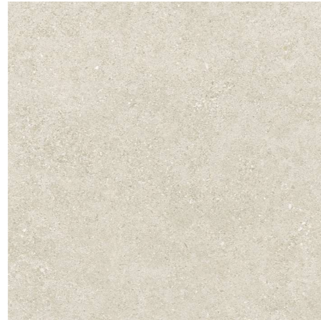
Roadstone Linen 90x90 cm

On main and secondary bedrooms Wood looking rectified porcelain Origin Umber, 22,5 x 180 cm as per below image.