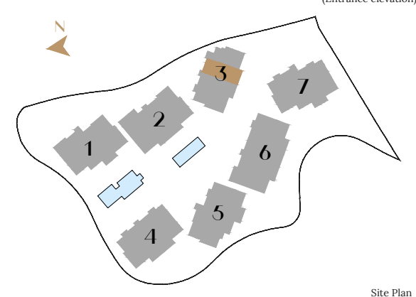
*All the surfaces detailed in this floor plan correspond to built areas.

The floor plan above is not final as it has been designed in accordance with the Building Execution Project and, consequently, THE VIEW CHASE DE-VELOPMENT I S.L. Reserves the right to include whatever changes due to thechnical and/or legal imperatives required by any public Administration or Agency. Thes changes, in any case, will be in accordance with the progress of the construction work. The accesory elements (for example, including the kitchen) are merely for illustrative purposes. The rotation sense of doors and the distribution of sanitary fittings are not binding. The surface areas shown are approximate and, may be altered for technical and/or legal reasons in the course of the construction work.